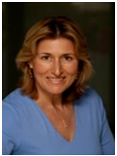
the Navajo Nation.

Prior to joining Accenture, she served in the Executive Office of the President, Office of the US Trade Representative from 1995 to 1999. As Assistant USTR for Congressional Affairs, she played a key role in Congressional votes on trade relations with China, the WTO, and NAFTA implementation.